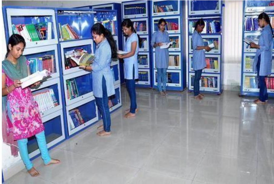
Library reading hall with plenteous infrastructure and resources (Main Building)